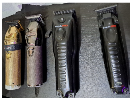
Figure 3: Razors for hygienic-microbiological examination