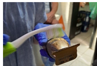
Figure 1: Sampling using brushes

ment in cooperation with the Department of Dermatology at the University Hospital Schleswig-Holstein, Kiel Campus. Samples were taken from surfaces using brushes and imprints on dermatophyte-selective agar plates (with cycloheximide and gentamicin) (Figure 1 and Figure 2). Surfaces and devices were selected for examination that were possible sources of infection, including storage surface for razors, drawer for razors, four different razors (Figure 3) and the head washbasin. The selective agar plates were incubated at 27 °C for 28 days.