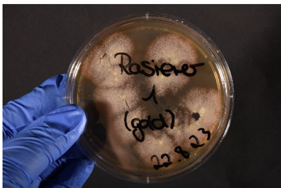
Figure 5: Growth of T. tonsurans , imprint of a razor

Hygienic microbiological sampling in Barbershop A revealed the presence of T. tonsurans in three out of ten samples tested. The detection was carried out on two razors, one of which showed pronounced growth (Figure 5), as well as in the drawer in which razors were stored (Figure 6).