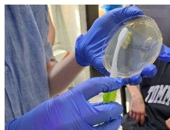
Figure 2: Imprint on dermatophyte selective agar plates