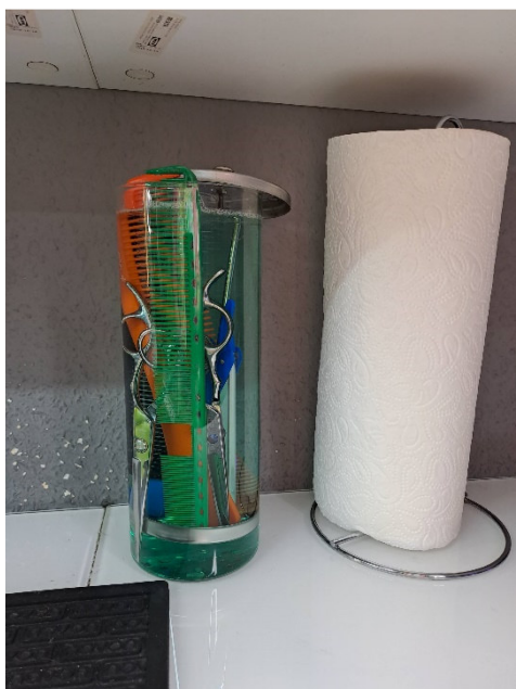
Figure 4: Device reprocessing at the time of the first inspection

Barbershop A was not aware of the requirements of the Hygiene Ordinance, including the requirement to use VAH-listed disinfectants. No hygiene plan was available. Some of the work materials were reprocessed with an aldehyde-based instrument disinfectant in very high concentrations without completely wetting the materials to be reprocessed in a glass container commonly used in barbershops (Figure 4). The surfaces and some work materials were treated with commercially available drugstore products and additionally with special cleaning agents. Towels were washed at 40 °C and machine dried.