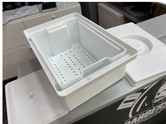
Figure 7: Newly purchased instrument disinfection tray

The elimination of the hygiene deficiencies was checked during further site inspections. Information materials on the requirements for hygiene measures in accordance with the Hygiene Ordinance and the creation of a hygiene plan were handed out and the conversion and establishment of proper reprocessing of work materials was accompanied (Figure 7)