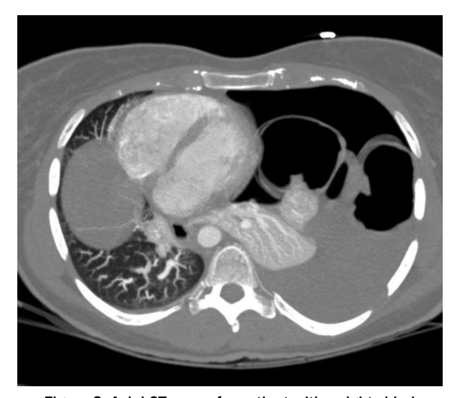
Figure 2: Axial CT-scan of a patient with a right-sided diaphragmatic hernia. Tension-pneumothorax due to an intrathoracal gastric perforation.

Multi-slice spiral CT-scan (Figure 2) has a sensitivity as high as 80% with a specifity of 100%, according to various studies [11]. Moreover, when used as a diagnostic tool in patients with blunt or penetrating trauma or poly-traumatized patients it allows a fast and reliable scanning of all concomitant injuries. We observed a correct diagnosis by CT-scan in 10 of 12 patients (83%) with no false-positive results. Thus CT-scan is to date the study of choice to detect diaphragmatic injury.